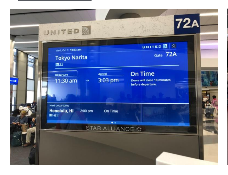
Our flight to Tokyo, Narita @ LAX