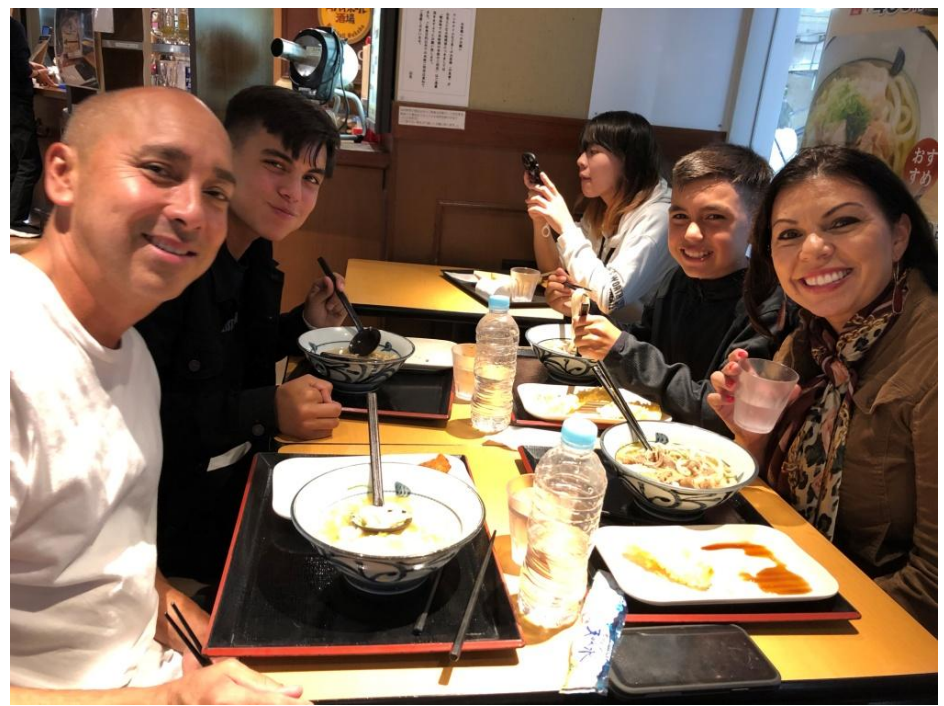
@ Noodle Shop