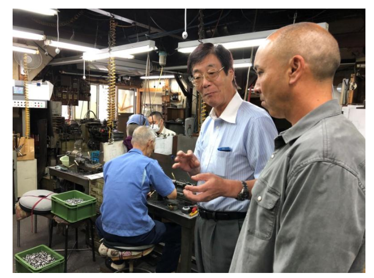
The factory Tour @ Nakamura Dental Mfg., Co., Ltd.