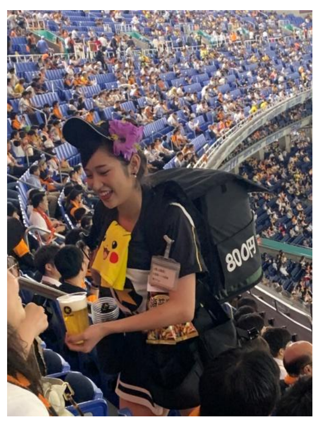
A young lady is selling beer out of a keg on the back.