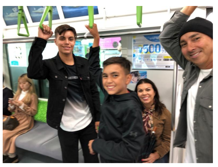
I<sup>st</sup> Train Ride @ Yamanote Green Line