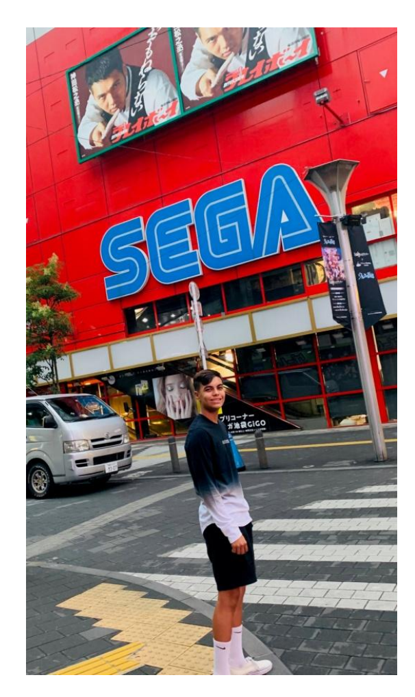
@ Street of Tokyo