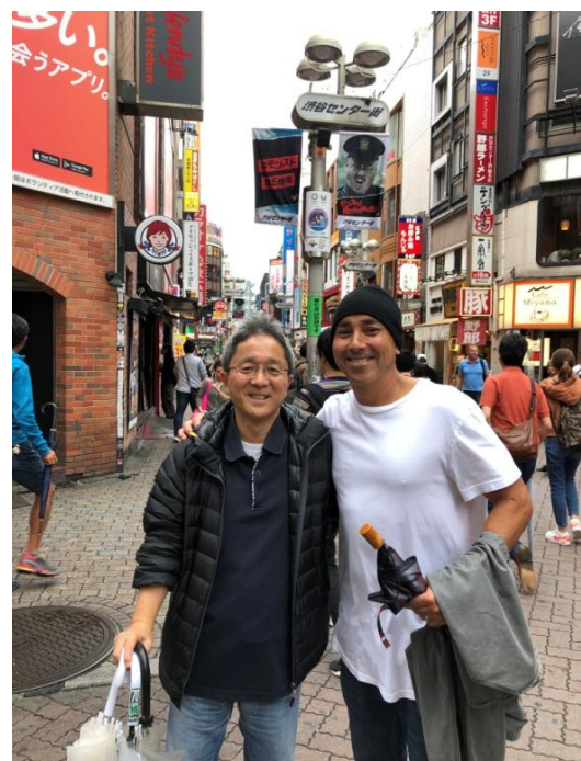
@ Street of Shibuya