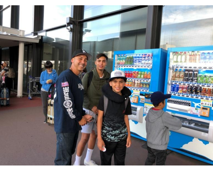
A lot of vending machines @ Tokyo, Narita